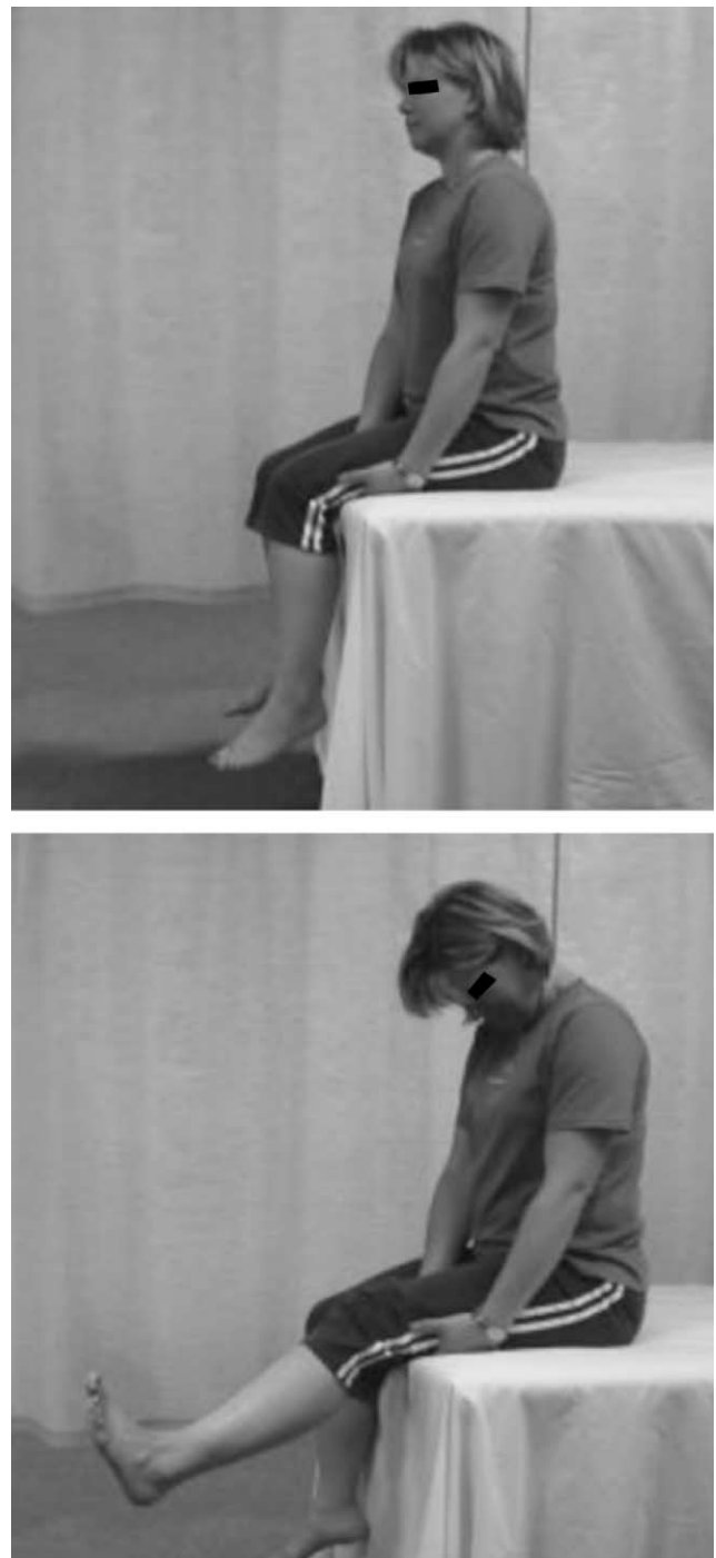
Fig. 5. Active neurodynamic tensile loading technique biased toward the tibial branch of the sciatic tract in a modified slump position.

Tal-Akabi and Rushton (2000) utilized neural tissue mobilization techniques in their randomized clinical trial on patients with carpal tunnel syndrome, but they did not specify whether ‘sliders’ or tensile loading techniques were