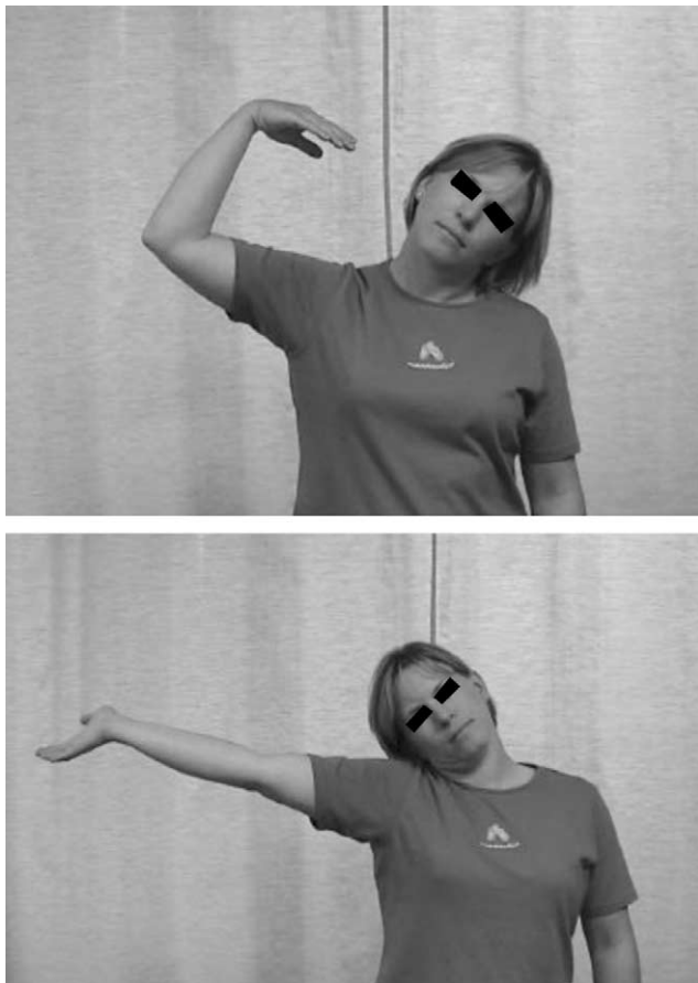
Fig. 4. Active neurodynamic ‘slider’ technique biased toward the median nerve.

As the name implies, the purpose of neurodynamic tensile loading techniques is to restore the physical capabilities of neural tissues to tolerate movements that lengthen the corresponding nerve bed. It is important to emphasize that tensile loading techniques are not stretches; these neurodynamic maneuvers are performed in an oscillatory fashion so as to gently engage resistance to movement that is usually associated with protective muscle activity (Butler, 2000; Shacklock, 2005). The vigor of technique may be adjusted to elicit gentle stretching sensations or to evoke mild symptoms in rhythm with each oscillation (Butler, 2000). Tensile loading techniques