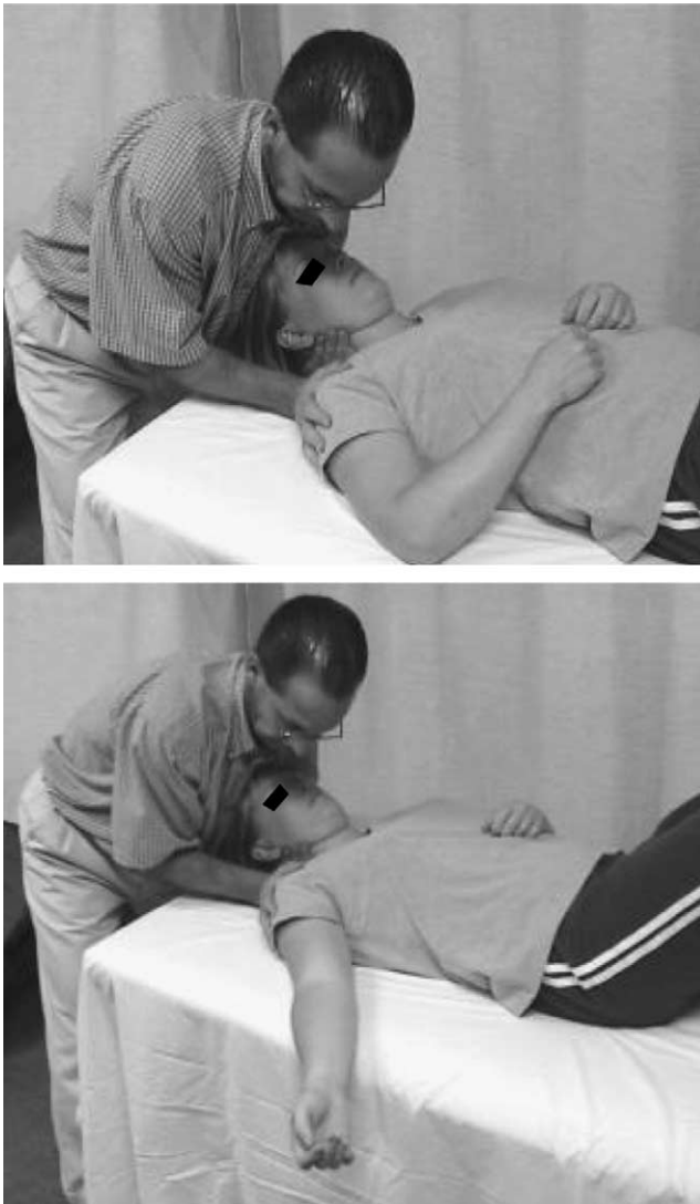
Fig. 2. Cervical lateral glide technique. The head and cervical spine are translated in an oscillatory fashion away from the affected upper extremity that can be placed in a neurodynamically unloaded (top) or loaded (bottom) position depending upon the desired vigor of treatment (Elvey, 1986).

Gliding techniques, or 'sliders', are neurodynamic maneuvers that attempt to produce a sliding movement between neural structures and adjacent nonneural tissues, and they are executed in a non-provocative fashion (Butler,