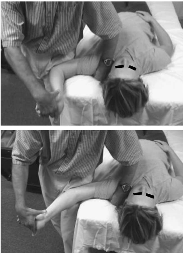
Fig. 6. Passive neurodynamic tensile loading technique biased toward the median nerve.

used. Neural tissue mobilization was more effective than no treatment for reducing pain and the need for carpal tunnel surgery, but neurodynamic techniques were no more effective than joint mobilization techniques that facilitated horizontal extension of the carpal bones. A clinical trial on Australian Rules football players with grade 1 hamstring strains and positive findings during the slump test demonstrated that supplementing a conservative management program with neurodynamic tensile loading techniques led to a faster return to competition (Kornberg & Lew, 1989). Tensile loading techniques, with or without ‘sliders’, have also been used successfully in case studies or single-subject design studies describing patients with signs of increased neural tissue mechanosensitivity in combination with lumbar-lower extremity symptoms (Cleland, Hunt, & Palmer, 2004; George, 2002; Klingman, 1999), heel pain (Meyer et al., 2002; Shacklock, 1995a), lateral epicondylalgia (Ekstrom & Holden, 2002), and cubital tunnel syndrome (Coppieters, Bartholomeeusen, & Stappaerts, 2004). In contrast, a randomized controlled trial clearly demonstrated that neural tissue mobilization did not provide any additional benefit to standard postoperative care in patients who had undergone lumbar discectomy, laminectomy, or fusion (Scrimshaw & Maher, 2001). Examples of neurodynamic tensile loading techniques are